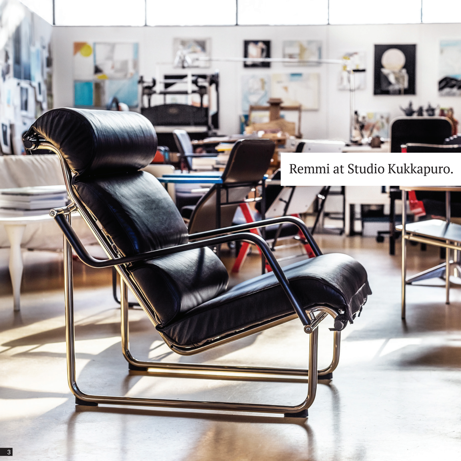
Remmi at Studio Kukkapuro.