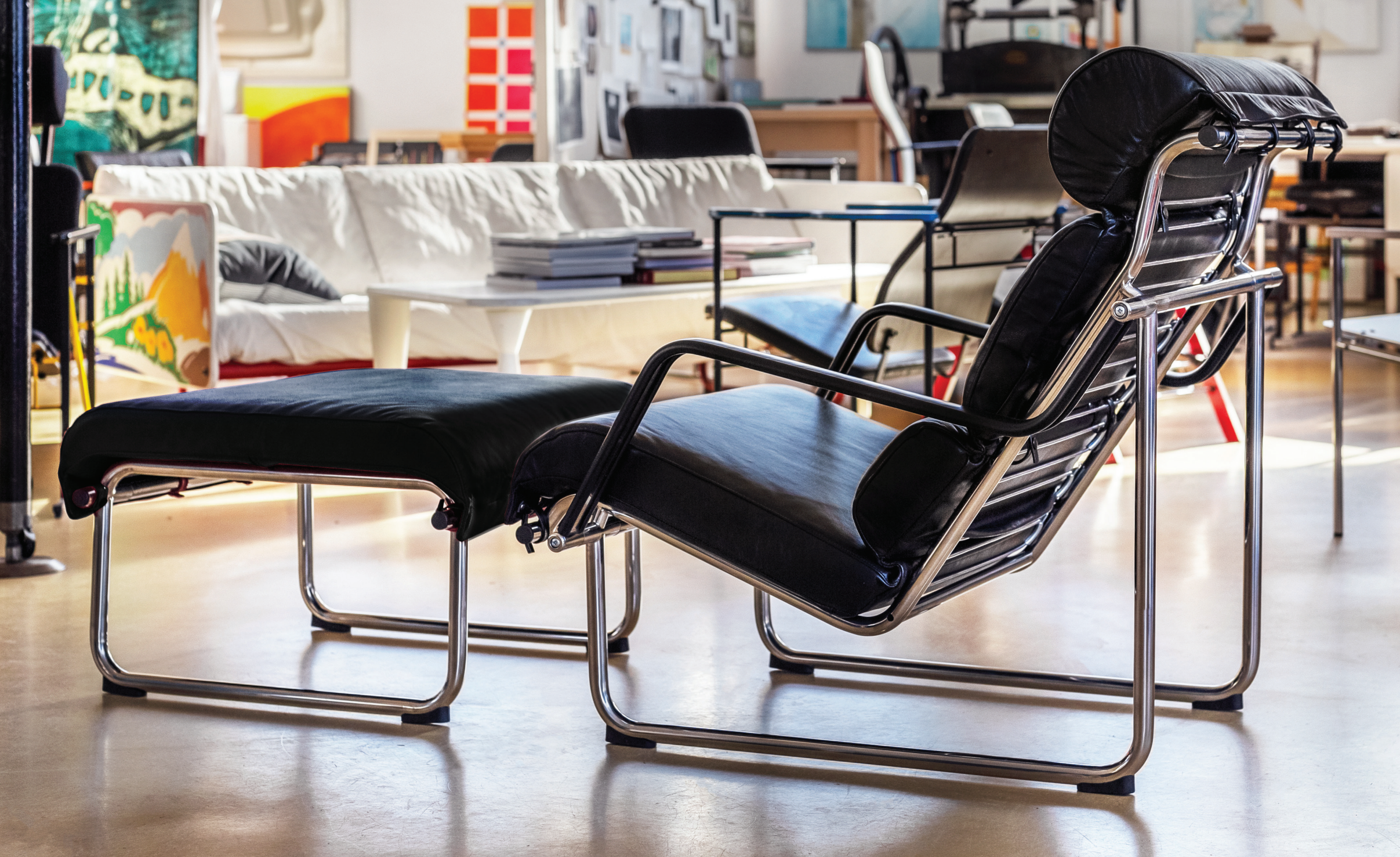
Meticulous care has been taken to make sure that the parts are interchangeable with the original parts now and in the future.

“All the parts are the same as they were originally”